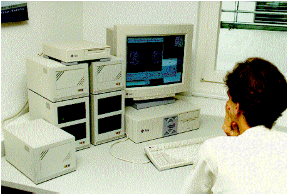
Figure 2: Digital aerial triangulation station at Swissphoto Vermessung AG.