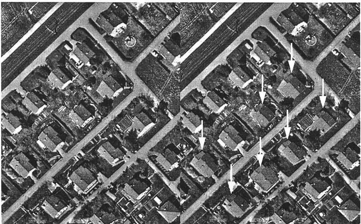
Figure 1: Ortho-image: (left) houses are radially displaced, (right) the houses indicated by the arrows are corrected a posteriori.

In ortho-images 3-D objects are displaced radially from the nadir, because there are not included in the DTM. There are more and more applications where such objects (especially buildings and elevated road structures) must be correctly represented either because they are of interest themselves, or because they otherwise hide other useful information. Such large-scale applications are becoming a big market. Automatic DTM generation by image matching should theoretically measure the visible surface, so DTMs derived by these means could be used in the ortho-image generation. However, in large-scale urban scenes, matching algorithms generally have a poor performance caused by discontinuities, occlusions, shadows and large perspective differences. In this respect, a combination of area- and edge-based matching techniques could lead to a significant improvement. Even in this case, if a DTM must be subsequently interpolated from arbitrarily distributed points by one of the commercially available packages, problems could arise because most of them can not treat vertical surfaces. For all these reasons, a viable alternative is to measure the top surface of 3-D objects and either combine this information with the DTMs before ortho-image generation, or apply a posteriori corrections to the ortho-images. The latter approach is attractive because the measurement can occur in orthorectified stereo pairs as explained above.