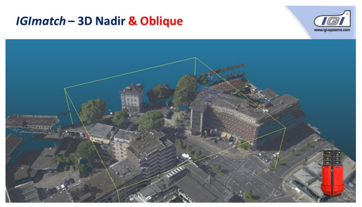
Figure 5: IGImatch 3D Nadir & Oblique View.

For Figure 4 only nadir imagery was processed and house façades have information lacks, using nadir & oblique imagery the house façades are clear and clean.