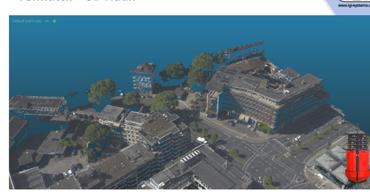
Figure 4: IGImatch 3D Nadir View.