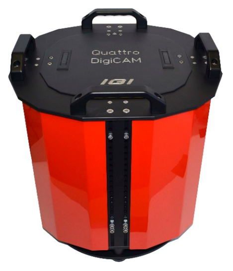
Figure 1: IGI Quattro-DigiCAM.