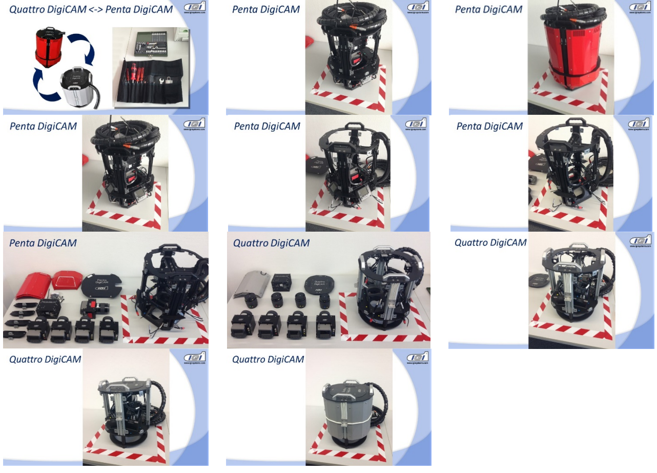
Figure 3: Conversion of an IGI Penta-DigiCAM to an IGI Quattro-DigiCAM.

Using up to five DigiCAM camera systems a Quattro-DigiCAM camera system can be converted into a Penta-DigiCAM camera. Figure 3 shows the conversion process which can be done by the operator himself within 2-3 hours. This smart solution gives the opportunity to use one camera system as large format and nadir + oblique aerial camera system.