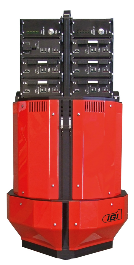
Figure 2: IGI Quattro-DigiCAM-Oblique & IGI Penta-DigiCAM.

The IGI Quattro-DigiCAM-Oblique is another housing for the Quattro-DigiCAM-300 system which offers the opportunity to use one aerial camera system for two purposes: the collection of nadir & oblique imagery.